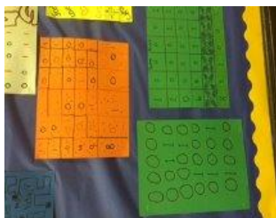
Ms. Ledford puts on display students who translated their birthdays into binary code.