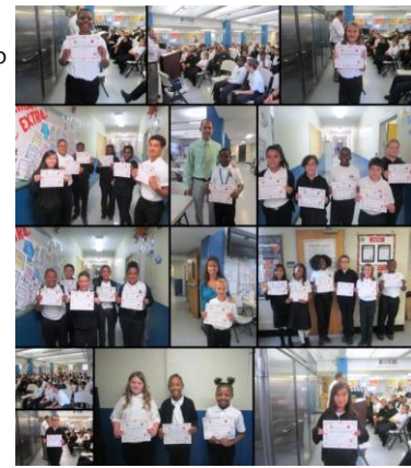
Some of our middle school Cadets of the Month and their teachers