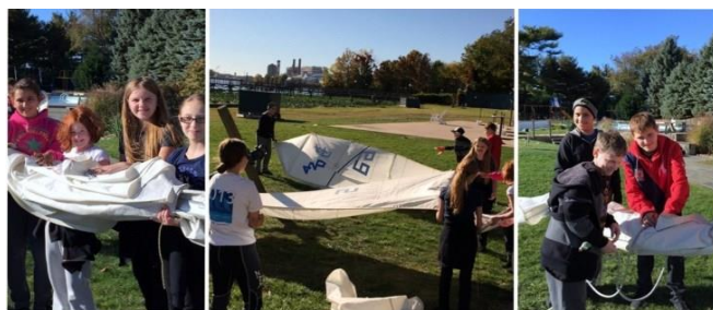
Sailing cadets working alongside the river at Corinthian Yacht Club